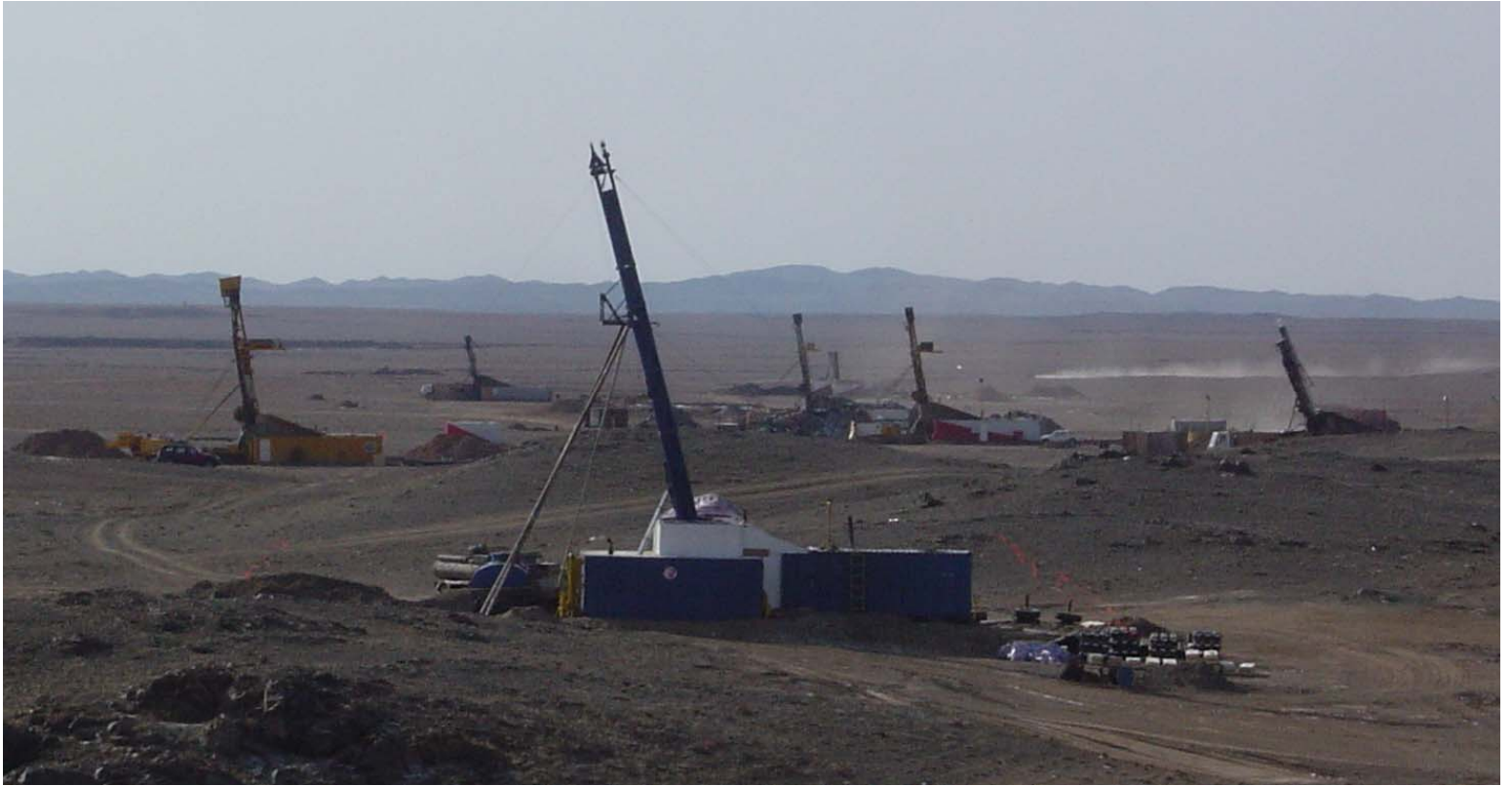
Ivanhoe's rigs drilling Hugo North Deposit, March, 2005.