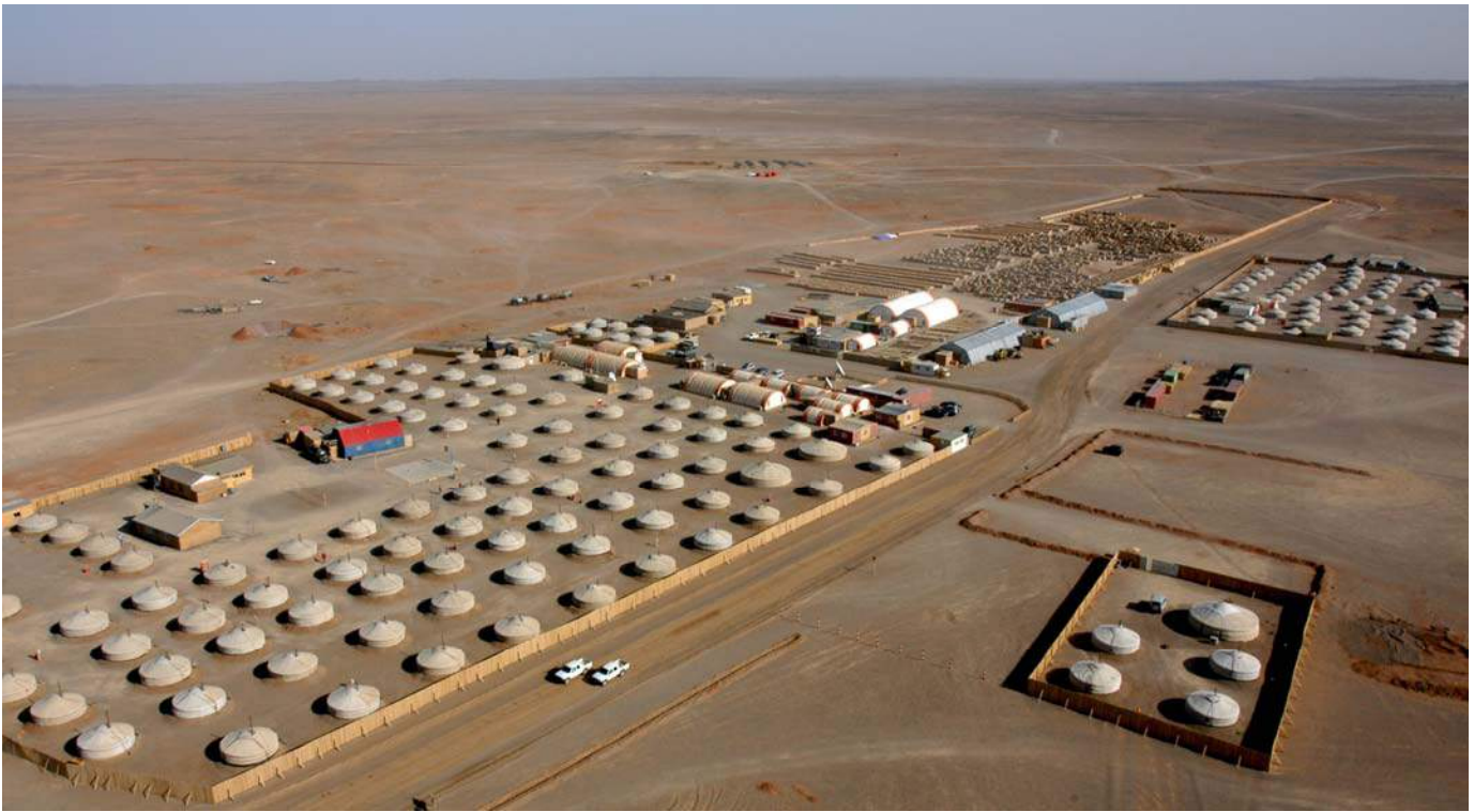
Oyu Tolgoi Mine Development Camp, April, 2005.